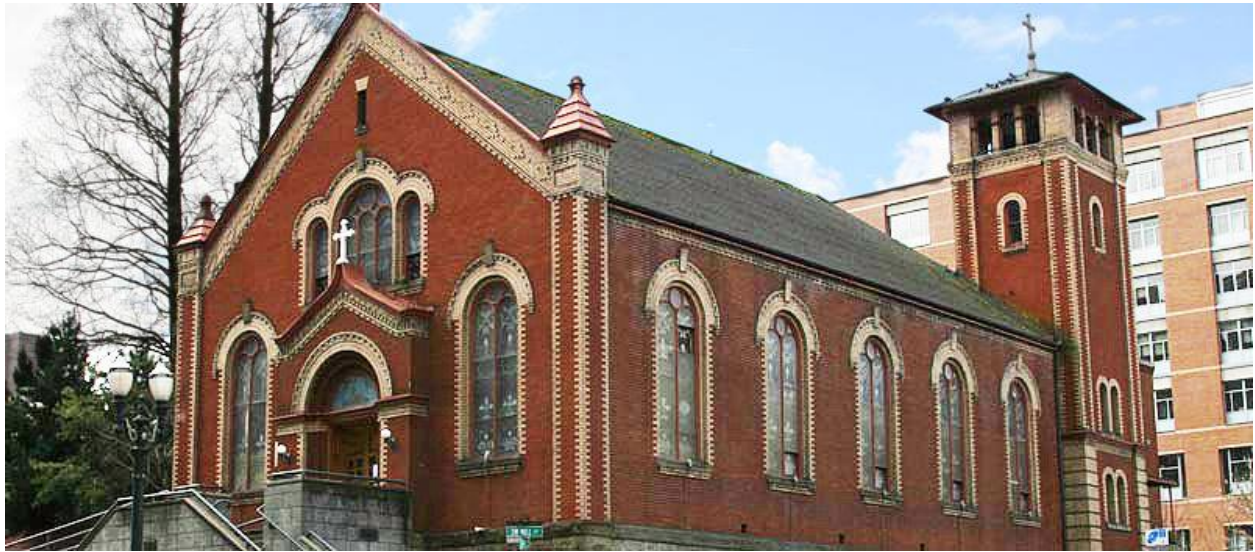
St Michael the Archangel Church

Lord, one that is only sustained by faith. Then we looked at different levels of faith, based on our human experience of being a child, being an adolescent, and becoming an adult. When we are in the stage of the faith of a child, everything comes easily. Like children with an unquestioned trust, so we trust in the Lord, and his grace fills our lives. Then we move to the faith of an adolescent. This is when we begin to question, for example to ask why our prayers aren't answered the way we want, or why things don't always go so well for us. We find ourselves doubting, wondering, and unsure of all this. This is the key and decisive period where people may give up. When we get through this we come to the faith of an adult. We have endured! And we are here now. It is the Holy Spirit which has brought us here. We live by faith. We are conscious of our sins and limitations, yet we know that through it all Christ is with us.