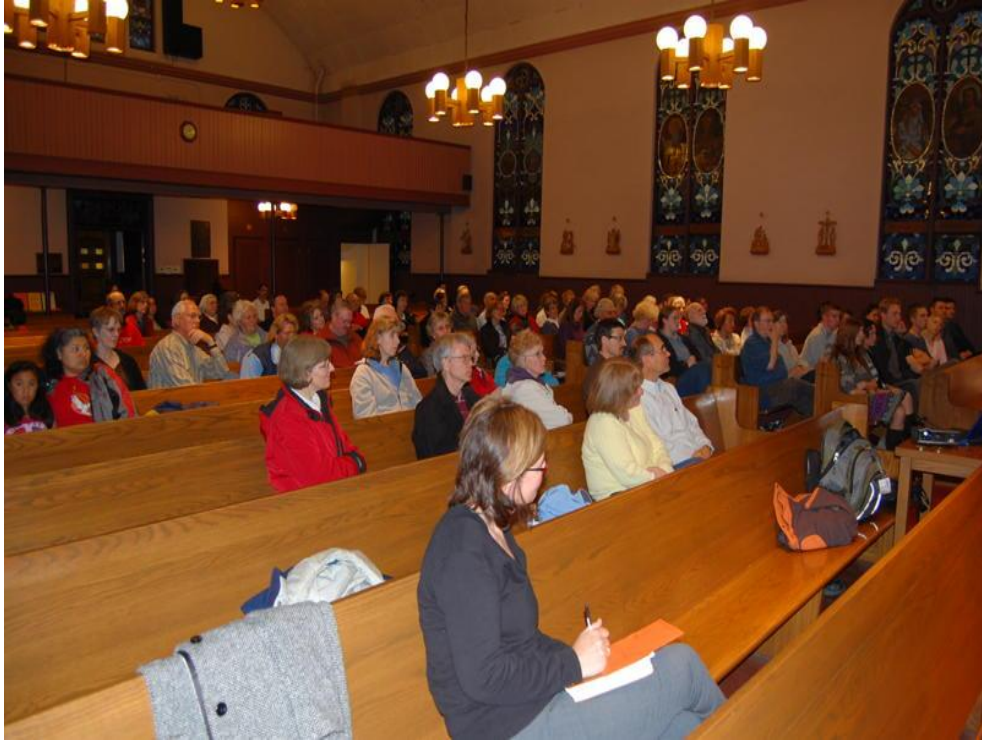
Some of the attendees at the prayer meeting.